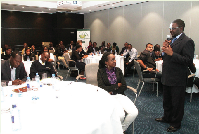
Kenya Industrial Property Institute MD giving a presentation during the Anti Counterfeit meeting.