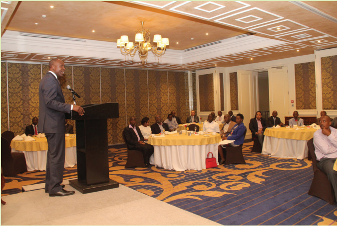
Cabinet Secretary Ministry of Agriculture, Livestock and Fisheries, Willy Bett, during the breakfast meeting with AAK members.