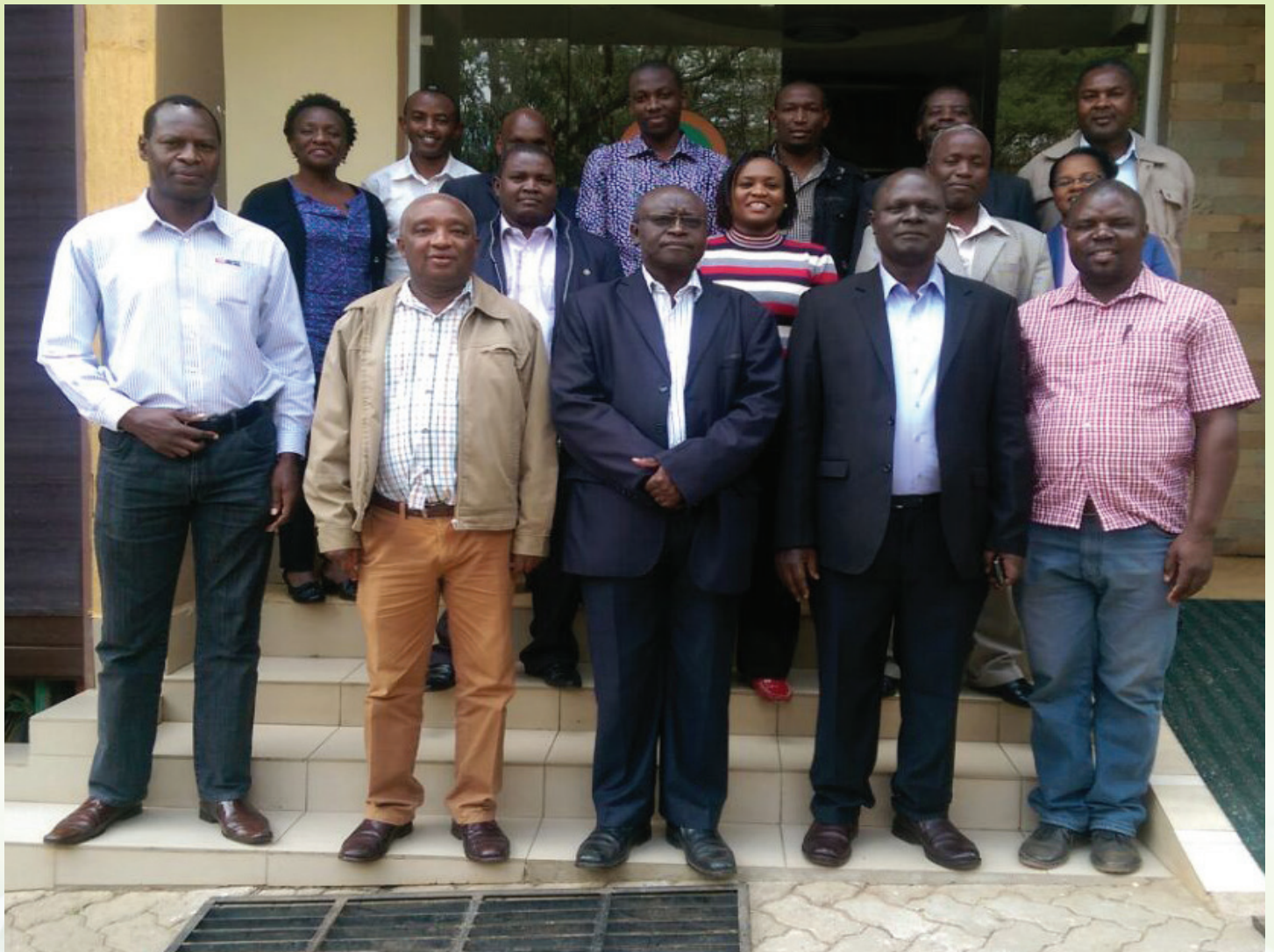
PARTICIPANTS AT THE WORKSHOP ON DRAFTING PCP BILL REGULATIONS 2016

AAK in collaboration with PCPB, Croplife Africa Middle East, Kenya Law Reform and the Ministry of Agriculture on 18 th -22 nd July 2016 held a workshop to draft the PCP Regulations under the Draft PCP Bill 2016 that is set to repeal the Pest Control Products Act (CAP 346 of the Laws Kenya). The regulations drafted in the workshop included: