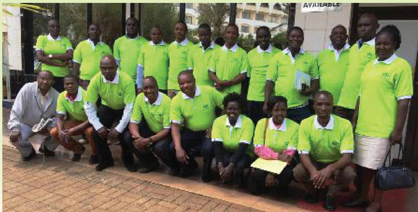
Participants of the Regional/Recruitment Meeting in Eldoret

AAK through the Publicity, Recruitment and Dealer Accreditation Sub Committee held a regional meeting, for the key distributors on Thursday, 25th August 2016 at Cicada Hotel, Eldoret. The main objective of the meeting was to bring on board and or to recruit more distributors/stockists' to the Association.