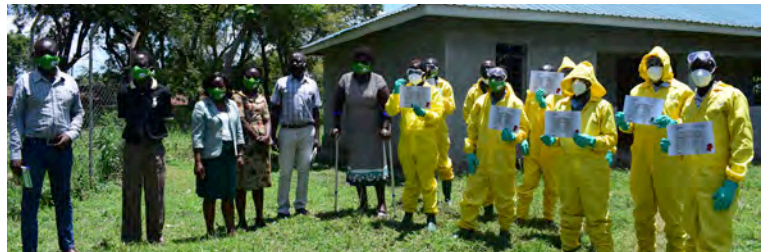
SSPs group photo, Matayos Sub-County

Busia and Siaya. The events provided an opportunity to officially introduce the SSPs to the Ministry of Agriculture and the host agro-dealers.