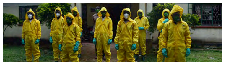
SSPs group photo, Butula Sub-County