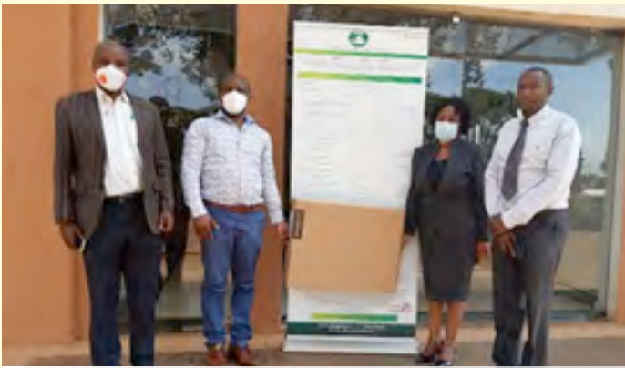
Computer donation by AAK for electronic dossier submission on 15 October 2020.

Therefore, the authority found it necessary to implement an electronic dossier submission technique as a temporary measure. Under this arrangement, dossier will be submitted in PDF formats via encrypted compact disks (CDs). The PDF should be secured by removing features that enables printing, copying, deleting and converting to other formats such as Word. It is against this backdrop that the PCPB requested CropLife Kenya/Agrochemicals Association of Kenya to support in funding the acquisition of infrastructure that will support electronic submission. The Association, with support from willing donors (Osho Chemical Ltd) responded to this call and donated 2 computers to PCPB to aid in this process.