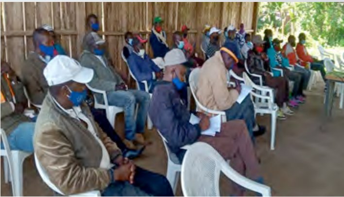
Farmers from Kibirichia during the training

Agrochemicals Association of Kenya (AAK) in partnership with Vegpro Ltd organized farmer training programs in key French Bean production regions in Kenya. Targeted areas include Kaiani in Kathiani, Machakos County, Kimana area in Oloitokitok, Kajiado County, Njukini area in Taveta County, Kandara South, and Gatanga in Muranga County, as well as Kibirichia and Kiambogo in Meru County. This training aimed to promote the production of high-quality horticultural crops to enable farmers (exporters) to access the lucrative European Union Market and address the issue of illegal and counterfeit products finding their way into the country through porous borders. Pest management and disease control with MRL Interceptions was the main area of concern. A total of 420 farmers were trained in the said 7 locations. All the trainings were represented by Vegpro Ltd field officers, technical assistants, agronomists, and area managers who also formed part of the team.