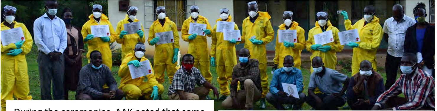
SSPs group photo, Teso South Sub-County

During the ceremonies, AAK noted that some SSPs already began selling their services to farmers. Some ventured into agro-dealer businesses, while others formed organized groups/platforms, which they regard as part of the strategies for marketing their services to farmers. The platforms are also meant to network and receive new information as well as financial support. One of the SSPs in Siaya County was recognized by the County Government and is currently engaged by the County to manage one of the horticultural projects under the youth initiative programs.