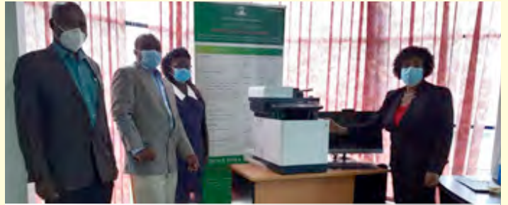
Computer Donation by AAK and Osho Chemicals Industries on 15 October 2020

The Covid-19 pandemic and containment measures have stifled activities and disrupted trade and lifestyles. Due to this, the government announced new protocols on how to adapt to the new normal. The containment measures have negatively impacted dossier submission processes at the Pest Control Board (PCPB) to the extent that no dossier was accepted since the first containment measures were announced in March 2020. This coupled by lean staff at the Board has hindered the process and velocity of product registration.