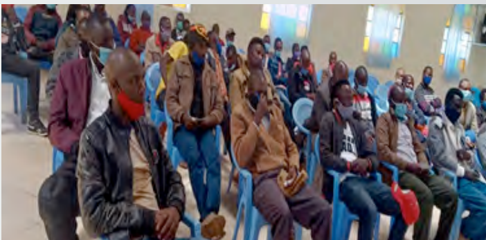
Kiambogo of Buuri West farmers attending the training

Agrochemicals Association of Kenya (AAK) in partnership with Vegpro Ltd organized farmer training programs in key French Bean production regions in Kenya. Targeted areas include Kaiani in Kathiani, Machakos County, Kimana area in Oloitokitok, Kajiado County, Njukini area in Taveta County, Kandara South, and Gatanga in Muranga County, as well as Kibirichia and Kiambogo in Meru County. This training aimed to promote the production of high-quality horticultural crops to enable farmers (exporters) to access the lucrative European Union Market and address the issue of illegal and counterfeit products finding their way into the country through porous borders. Pest management and disease control with MRL Interceptions was the main area of concern. A total of 420 farmers were trained in the said 7 locations. All the trainings were represented by Vegpro Ltd field officers, technical assistants, agronomists, and area managers who also formed part of the team.