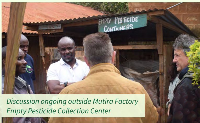
Discussion ongoing outside Mutira Factory Empty Pesticide Collection Center

Through the SPMF led trainings on responsible use, the quality of coffee produced has increased earning the societies wider markets and more premiums. The premiums have been used for factory development such as replacing wooden coffee drying beds with metallic ones, an initiative that contributes to environmental conservation.