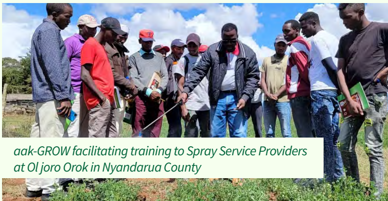
aak-GROW facilitating training to Spray Service Providers at Ol joro Orok in Nyandarua County