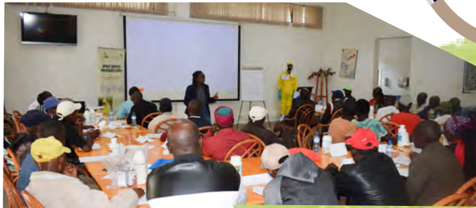
NKG Coffee Mills