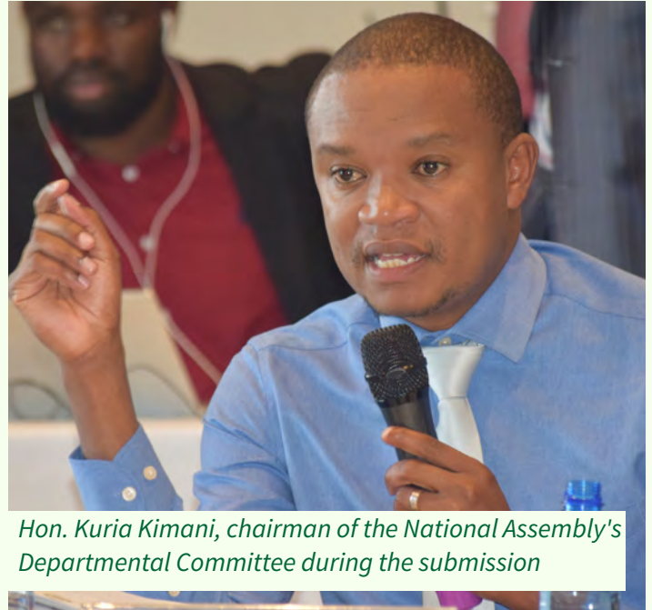
Hon. Kuria Kimani, chairman of the National Assembly's Departmental Committee during the submission

The move from zero rated to exempt would have had the farmer bear the high cost of production hence food insecurity, reduced household income, increased unemployment and social vices among others. This notwithstanding the fact that farmers are already burdened by a high cost of production where up to 30% is attributed to pest management.