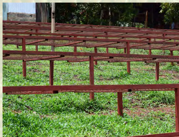
Metallic coffee drying beds