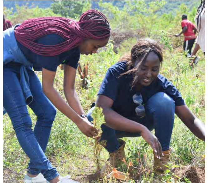
aak-GROW staff members participating in the tree planting event

The annual Forest Challenge convenes corporate organizations and individuals to raise funds for conservation through adventure sports. Funds raised through this initiative are channelled towards rehabilitation of the degraded forest areas in Mau and Aberdare forest ecosystems.