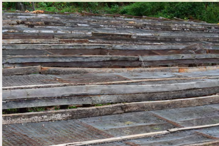
Wooden coffee drying beds

Through the SPMF led trainings on responsible use, the quality of coffee produced has increased earning the societies wider markets and more premiums. The premiums have been used for factory development such as replacing wooden coffee drying beds with metallic ones, an initiative that contributes to environmental conservation.