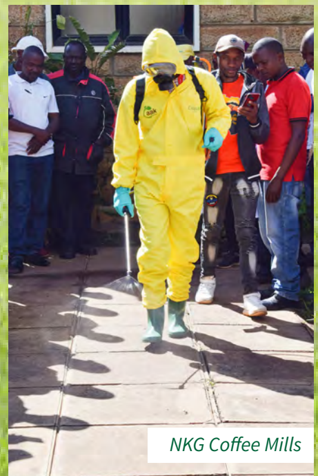
NKG Coffee Mills