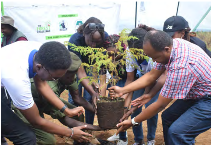
aak-GROW staff among other event participants plant a ceremonial tree

In support of the 30% national tree cover by 2032, aak-GROW alongside other organisations participated in this year's Forest Challenge Tree Planting event held at Kinale Forest, Kiambu County where 5000 trees were planted. The event is an extension of the annual 'Forest Challenge' organized by Kenya Forest Service, East African Wildlife Society and Kijabe Environment Volunteers that brings together sponsors of the previous year's event to a tree planting exercise.