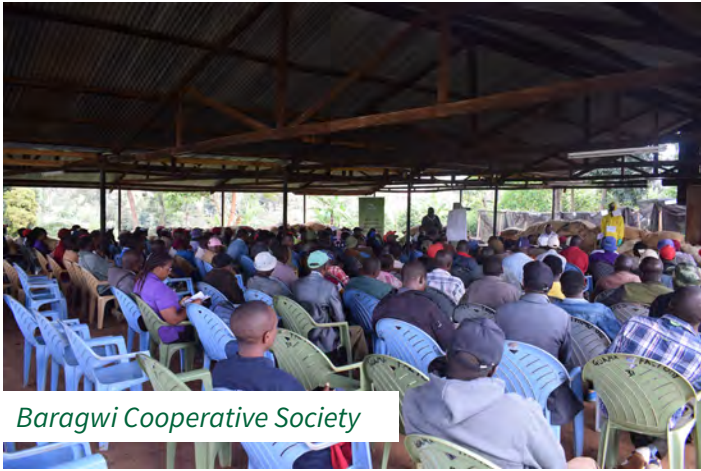
Baragwi Cooperative Society