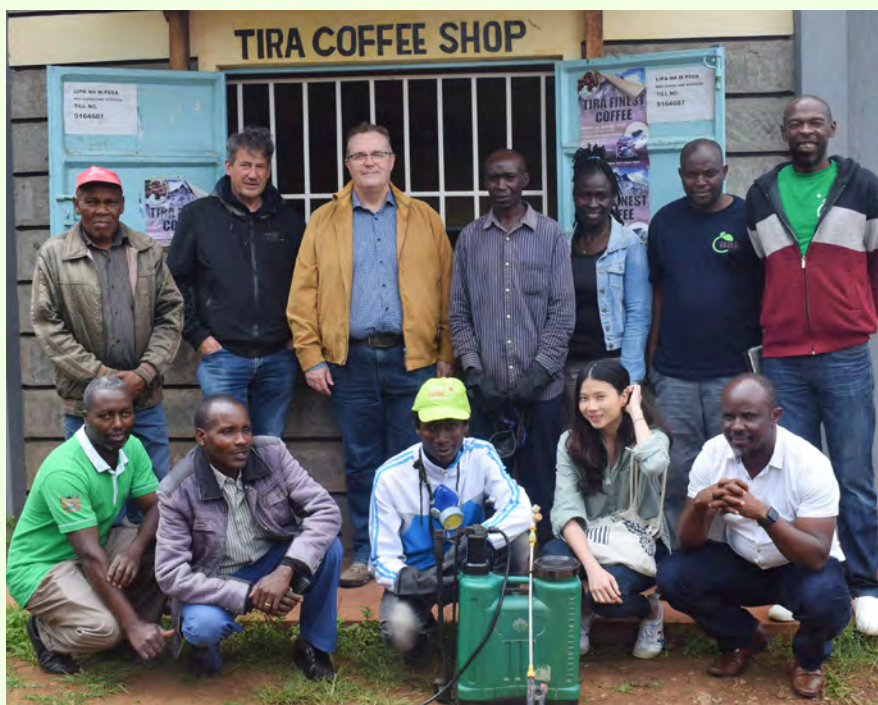
Members of CropLife International, aak-GROW, Mutira Society Manager and local Spray Service Providers pose for a photo during the visit

While in Kenya, members of CropLife International visited Mutira and Mwerua Coffee Cooperative Societies in Kirinyaga County to witness some of the impact of the Sustainable Pesticide Management Framework (SPMF) in Kenya over a span of two years.