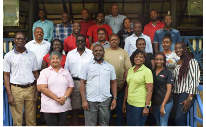
aak-GROW Board Members, Sub-Committee Heads and Secretariat during the board retreat at Diani Reef Resort, Ukunda

During the retreat, the team also engaged in the following activities: