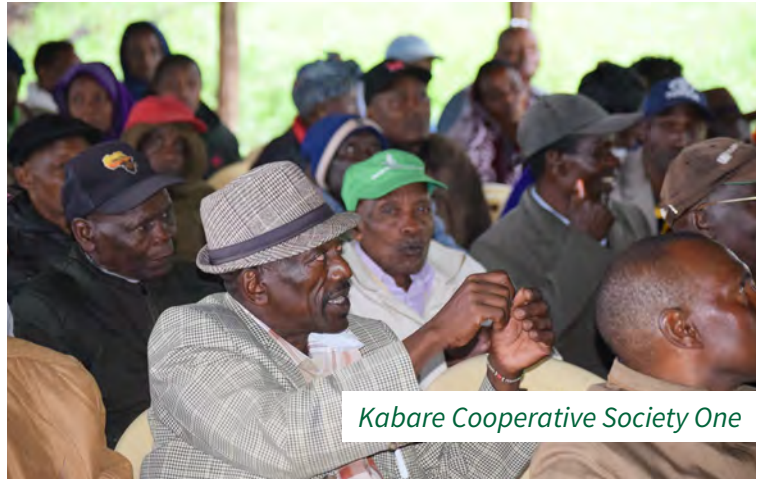
Kabare Cooperative Society One