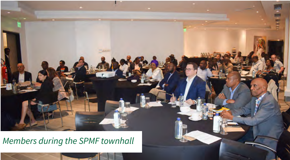
Members during the SPMF townhall